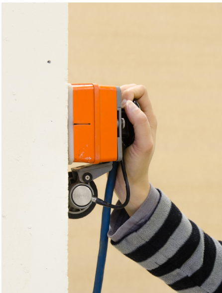
Scanning a wall to determine thickness. Antennas with different central frequencies can be used to provide different penetration depths.